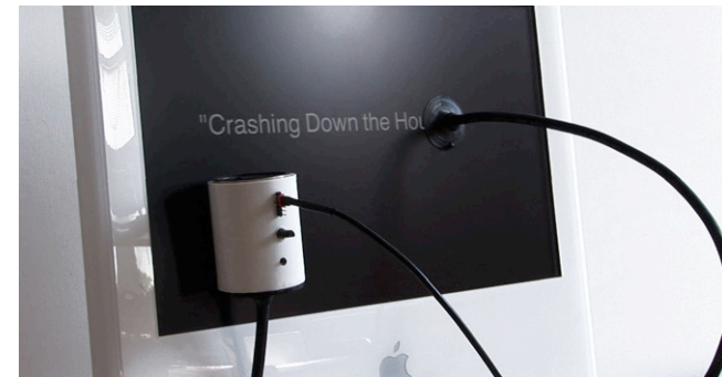
figure 1. The Elocuter with its suction cup and integrated photocell reading a news headline off the computer screen.

computer's USB port. Technically, the Elocuter is harvesting news headlines reflecting the economic crisis from online sources such as CNN, Bloomberg and the New York Times. A custom program displays these headlines as scrolling text, similar to stock market quotes, in white letters on a plain black background. The Elocuter reads the brightness value of each letter with a photocell and pairs this value with an allophone. In this process words are translated into impossible sequences of allophones similar to a Dada poem. Inspired by Dadaism, but addressing our own digital context, we are consciously creating a paradoxical situation: mixing the extreme rationality of computers and the irrationality of dada language play.